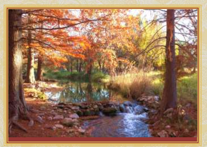
The artesian spring-fed, South Concho River runs year around

You and your fiancée are welcome to choose service providers including caterer, D.J. or band, photographer and others, provided prior agreement.