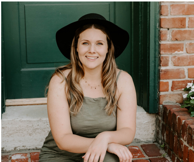
PHOTOGRAPHER . SISTER . CAT-DOG MOM . ECCENTRIC .