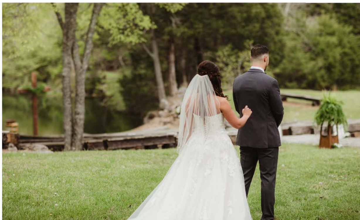
AN INTIMATE MOMENT SHARED.

Still not sure? No problem! If you prefer to keep the tradition of seeing each other for the first time as you walk down the aisle, I will create the perfect timeline for that as well. Either way, I have you covered!