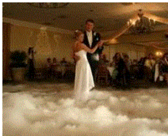
cold spark / cloud dance