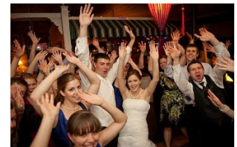
packed dance floor