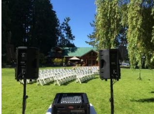
ceremony sound package