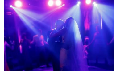
dance floor lighting system