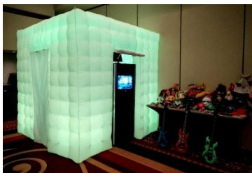
LED cube booth