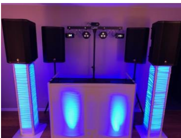
4 speaker façade sound