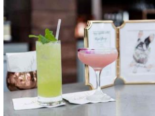
cocktail hour music