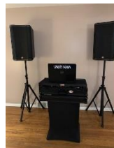
reception sound package