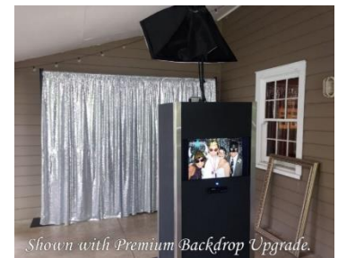
open air booth