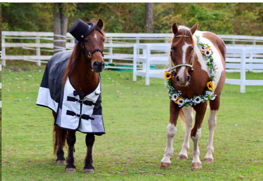
Admire the Horses Dressed in Bridal Costumes!