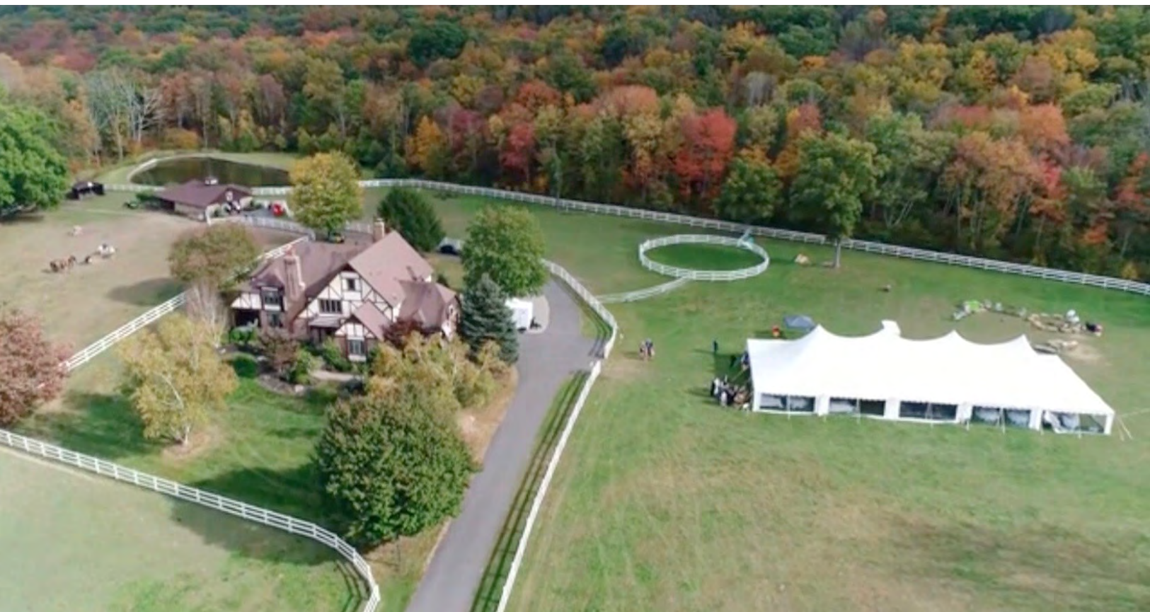
Outdoor Tented Reception