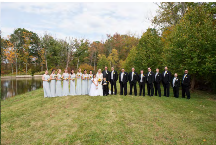
Bridal Party Photos by the Pond