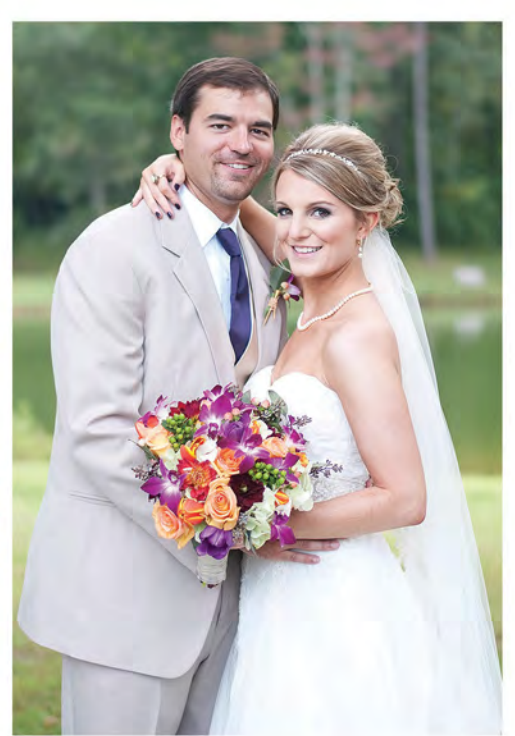
All you need is love.