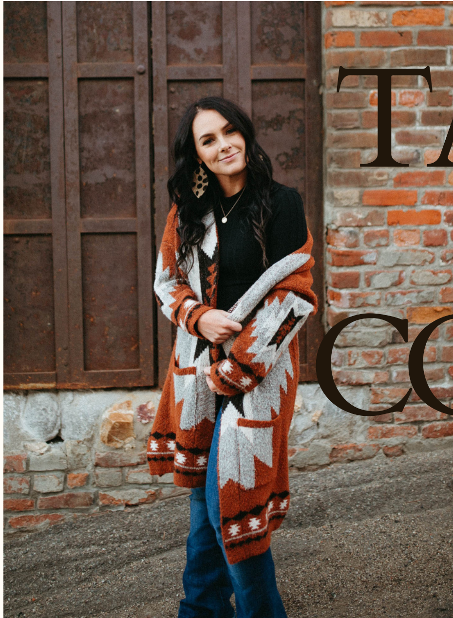
TABLE OF CON- TENT