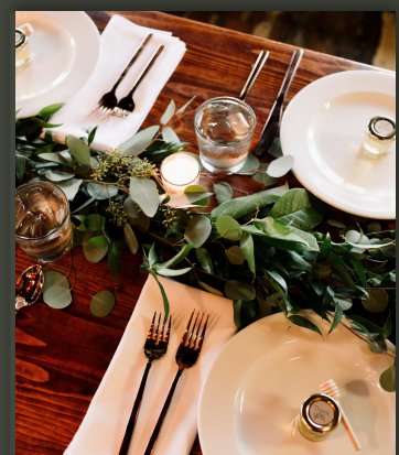
SEATED DINNER SERVICE