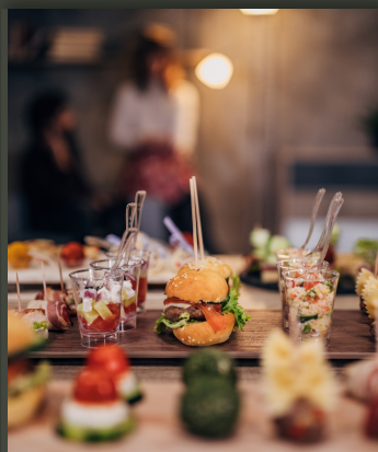
HORS D'OEUVRES & STATIONS