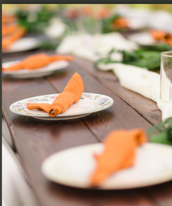
FAMILY STYLE DINNER SERVICE