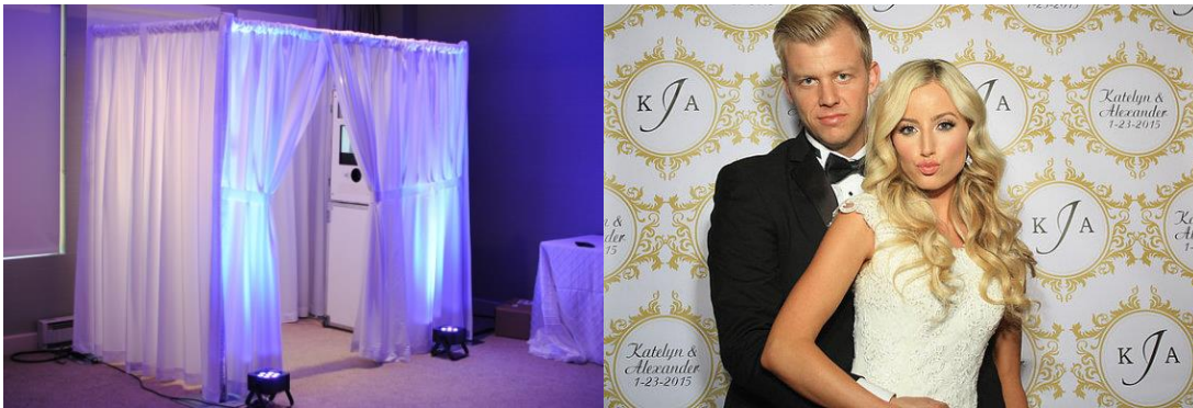
Photo booth Rentals Serving NJ, NY, CT, & Eastern PA We have the best equipment in the industry that has to offer We offer professional attention to our clients Our photo booths make a perfect addition to any event