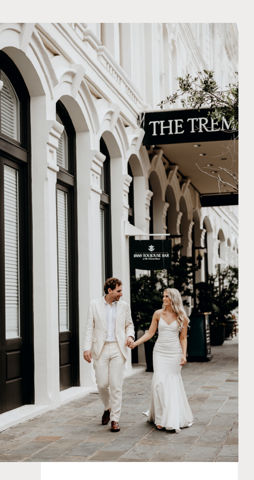
passionate storytelling & bold romance for untamed souls