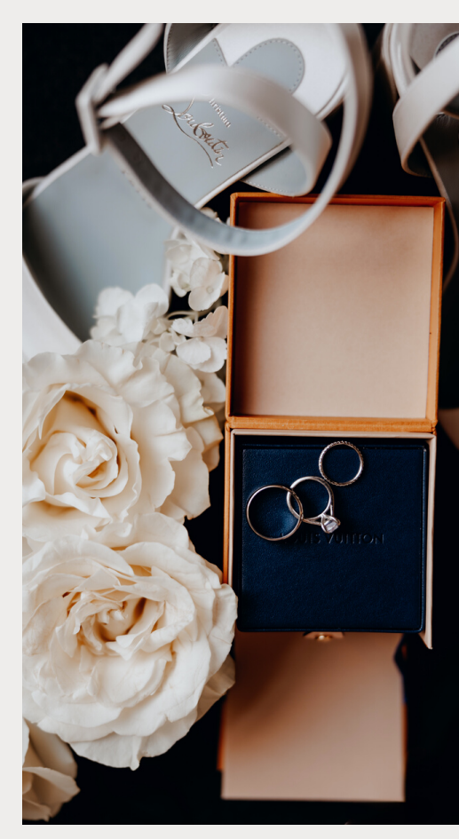
the magic is in the details...