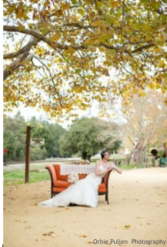
Orbie Pullen Photography