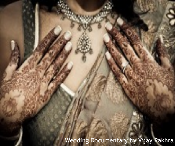
Wedding Documentary by Vijay Rakhra