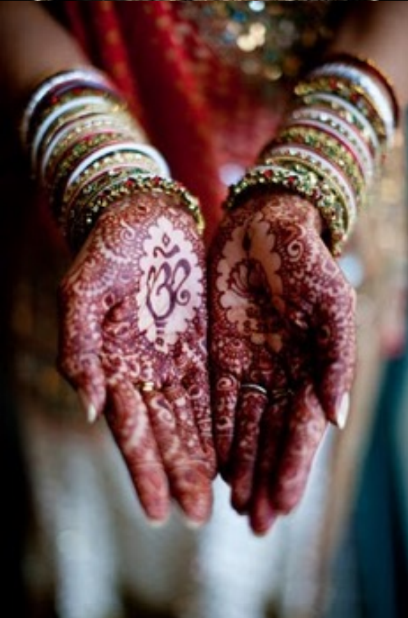
Wedding Documentary by Vijay Rakhra