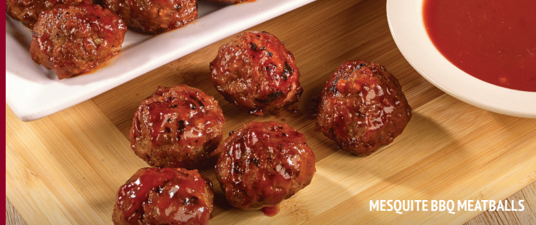
MESQUITE BBQ MEATBALLS