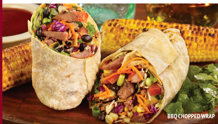
BBQ CHOPPED WRAP

*Small serves 25-30 / Large serves 50-55