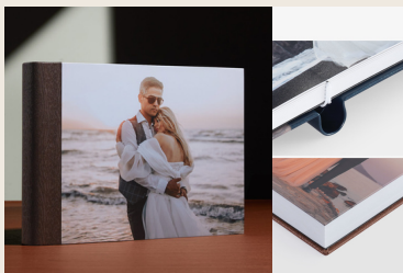
Photo Cover Album

Pages 12X12 - $22 per image Pages 14X14 - $28 per image Pages 11X14 - $25 per image Pages 12X16 - $30 per image