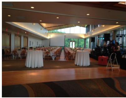
View of the Somerset Room from the Nathan Marsh Pusey Room