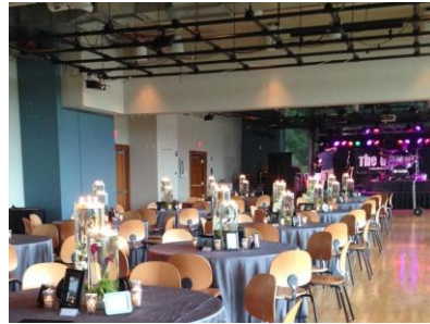
Esch Hurvis Studio, Esch Hurvis Room and Mead Witter reception with chair upgrade (upgrade involves a fee and is dependent upon availability)