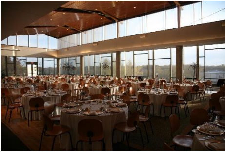
The Somerset Room is one of the most sought-after reception venues in the Fox Cities