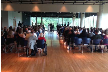
Esch Hurvis Studio & Esch Hurvis Room wedding ceremony with standard chairs