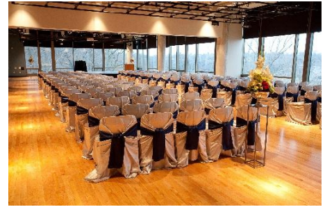
Esch Hurvis Studio & Esch Hurvis Room wedding ceremony with custom covered chairs (chair covers not provided by the Warch Campus Center - available through local rental business)

The Esch Hurvis Studio combined with the Esch Hurvis Room transforms into an ideal venue for wedding ceremonies, intimate receptions, rehearsal dinners and post-wedding brunches. Special design features include a modern open and unfinished ceiling and floor-to-ceiling windows which provide an airy and welcoming atmosphere. For wedding receptions utilizing both the Esch Hurvis Studio and the Esch Hurvis Room, the Mead Witter Room can be opened to provide a comfortable space for a bar area, cocktails, hors d'oeuvres and late night snacks. A customized room diagram based on your specific needs will be developed to help you better understand all of the possibilities within these unique rooms.