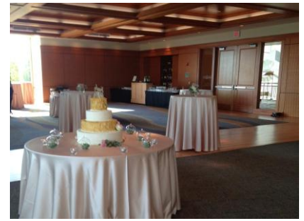
The Nathan Marsh Pusey Room provides an elegant setting for a ceremony or cocktails

Celebrate the beginning of a new life together in a one-of-a-kind setting in the grand ballroom of the Warch Campus Center during the University's summer, spring and winter recesses. For weddings with over 150 guests, these formal gathering spaces are combined to comfortably accommodate guests, cocktail receptions and late night snacks, bars, a dance floor, a band or DJ and banquet room. The Somerset Room features a maple floor, vaulted ceiling and a wall of floor-to-ceiling windows overlooking the Fox River. The Nathan Marsh Pusey Room is adorned with a rich quarter-sawn cherry interior, a cozy fireplace and breathtaking views. Whatever the wedding event, whether an intimate family brunch, sophisticated cocktail hour, elegant reception, rehearsal dinner, or post-wedding family gathering, our team will assist you or your wedding planner from planning to execution.