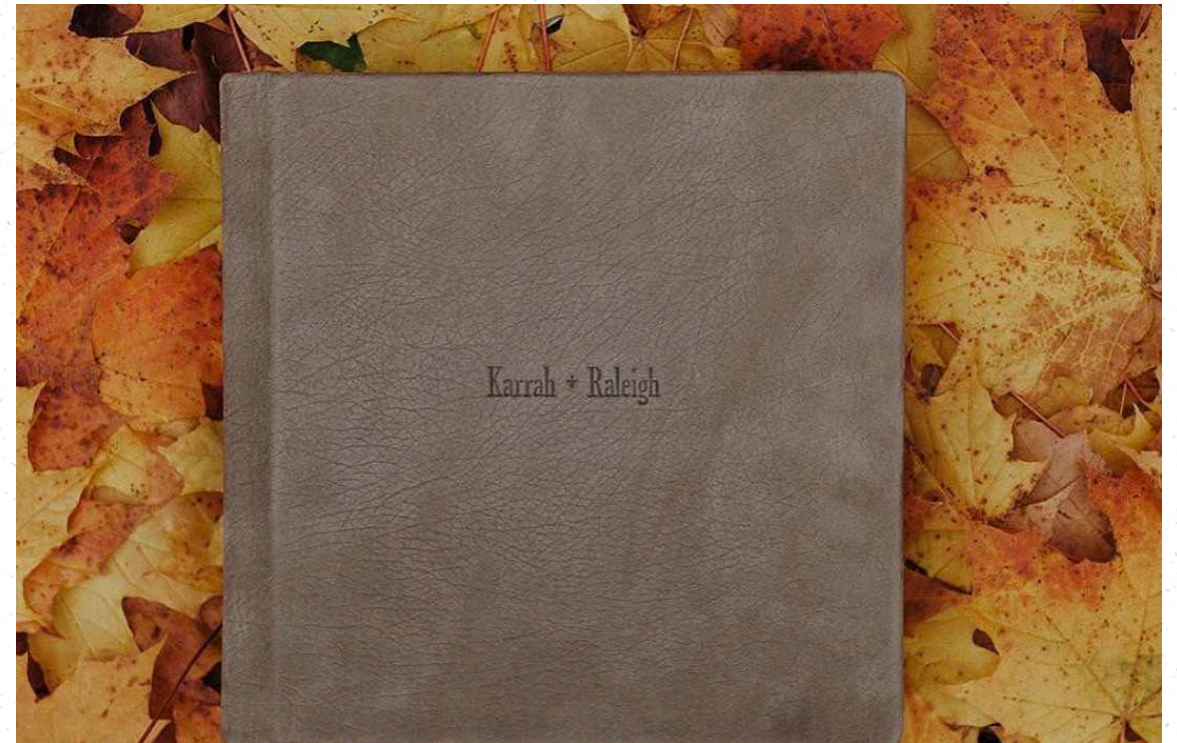
10x10 LEATHER ALBUM