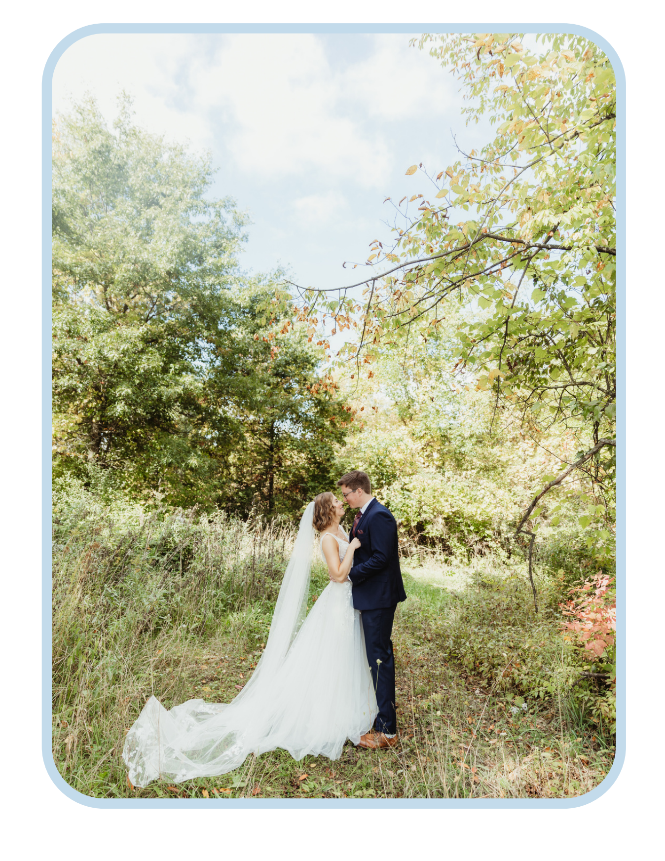
WEDDING INVESTMENT GUIDEBOOK HEIRLOOMS AND LACE STUDIOS 2024