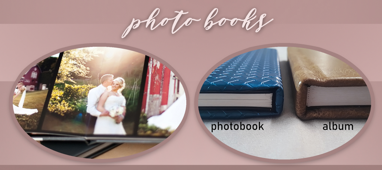
Photo books are very similar to albums. The pages lay flat when opened and both are printed on the same, high quality, photographic paper as the photo albums but do not have the foam core between pages.

These professional, high end albums have a thick core between the pages. The pages are made of high quality photographic paper and are custom designed with your images. One (1) page is considered the full spread when the book is open and laid flat, as pictured below. One page generally holds a minimum of 2 images and each half is referred to as a "print". There are several color options for the cover and they can be made with a cut-out window to reveal a photo on the cover. 20-60 images may be selected for the album design and additional pages are limited to 8 images per page.