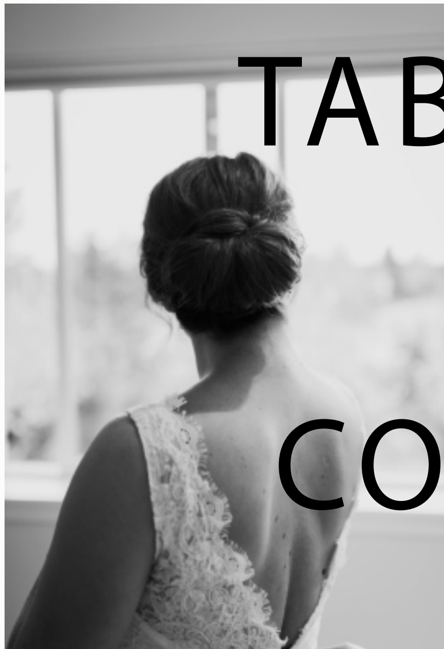
TABLE OF CON- TENTS