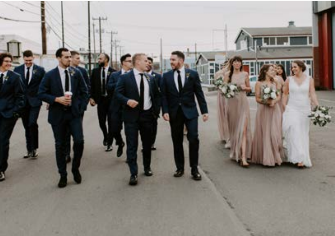
Bridal party shot / The Metropolist, 2018