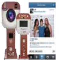
PHOTO PARTY STATION $895.00 - 3 hrs \ $1095.00 - 4 hrs

Instagram style filters, upload to social media, email & custom hashtags. Text photos to smart phones. Optional one-touch green screen backgrounds. Our Instacam photo booth resembles a Polaroid style camera. Prints with 4x6 or 2 strips. Great for large groups!