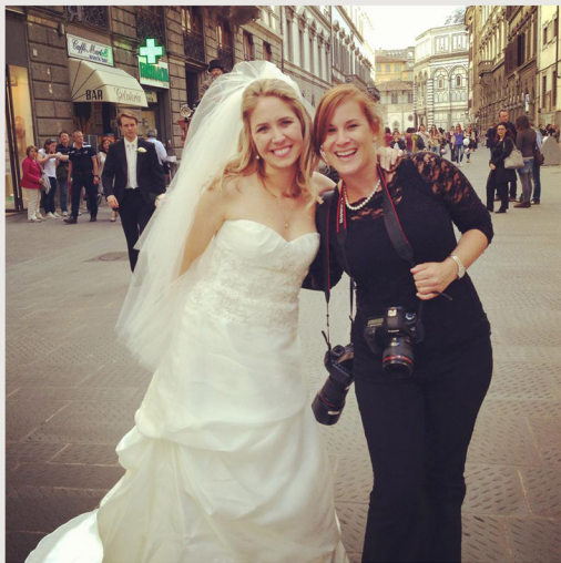
Florence Italy MAY 2013