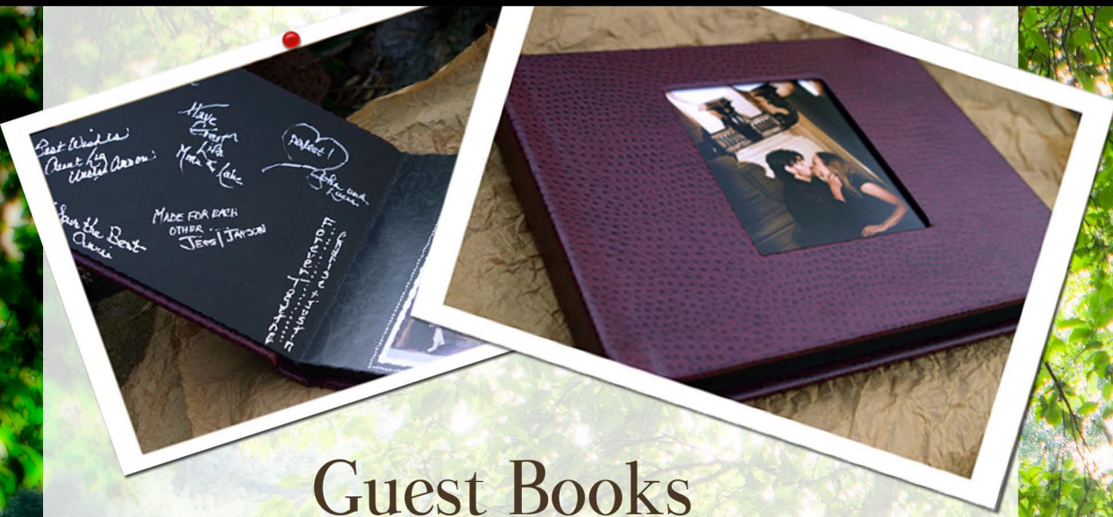
Guest Books $475