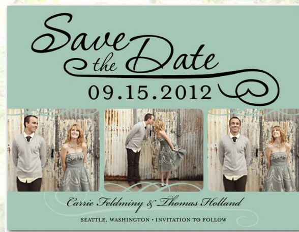
Save the Date Cards $125 for 50