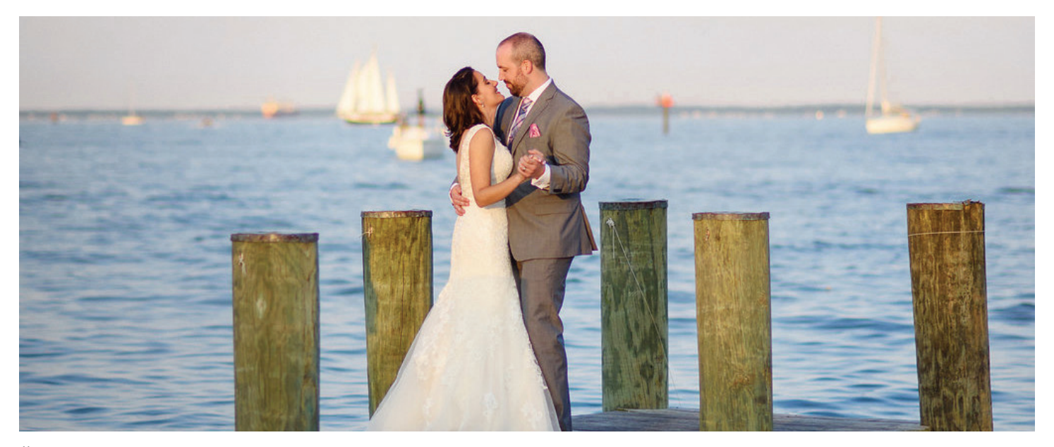
"A fun and charming venue with a beautiful view of the bay that guests enjoyed and a professional, caring staff insured an experience for guests that a hotel venue couldn't possibly provide.