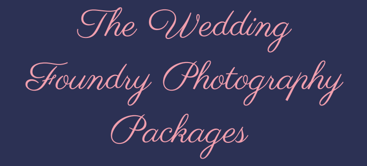
$1500 8-HOURS OF COVERAGE* CEREMONY & RECEPTION EDITS VIA ONLINE DELIVERY