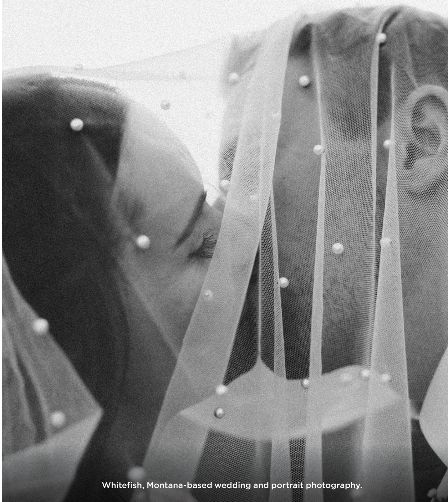
Whitefish, Montana-based wedding and portrait photography.