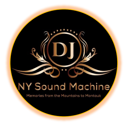
Photo Booth Services provided by: NYSM - POSE 4 PIX "We Capture Your Memories"

Phil: 631-804-9072 Phil@NYSoundMachine.com