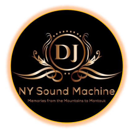
Photo Booth Services provided by: NYSM – POSE 4 PIX "We Capture Your Memories"

Phil: 631-804-9072 Phil@NYSoundMachine.com