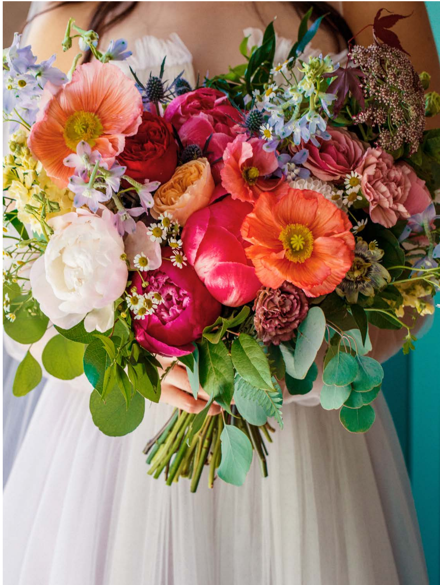
THE GOLD COLLECTIVE