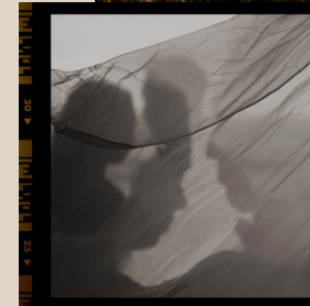
WHO: MOLLY AND LUKE WHAT: ELOPEMENT WHERE: BIG SUR