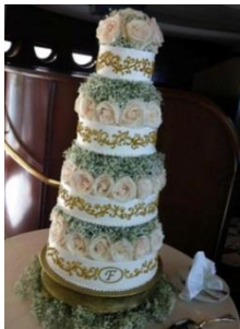
Maui Wedding Cakes