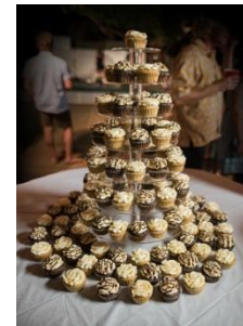
Cupcake Ladies Catering

*Consuming raw or undercooked meats, poultry, seafood, shellfish, or eggs may increase your risk of foodborne illness, especially if you have certain medical conditions.