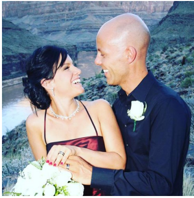
Men's Airbrush Make-Up