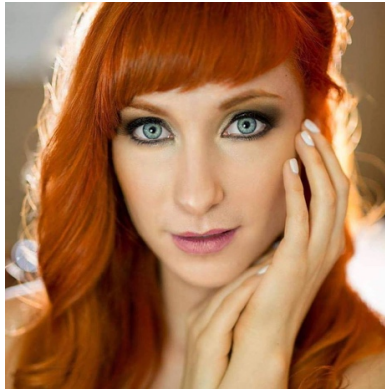
Hair and Make-Up Trial