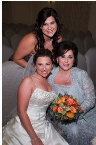
Bridal Hair & Make-Up