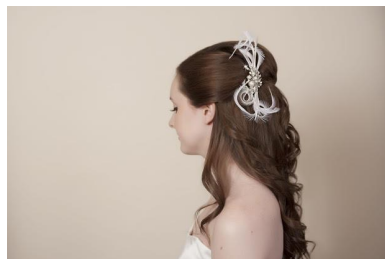
Hair Only Trial