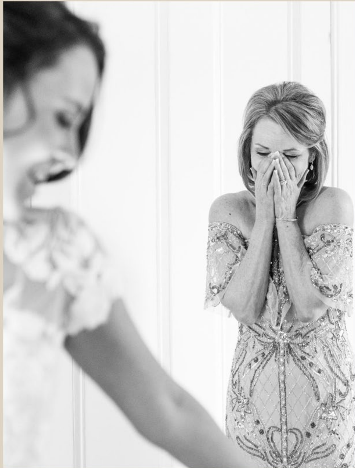
Charleston, SC | Wedding Day