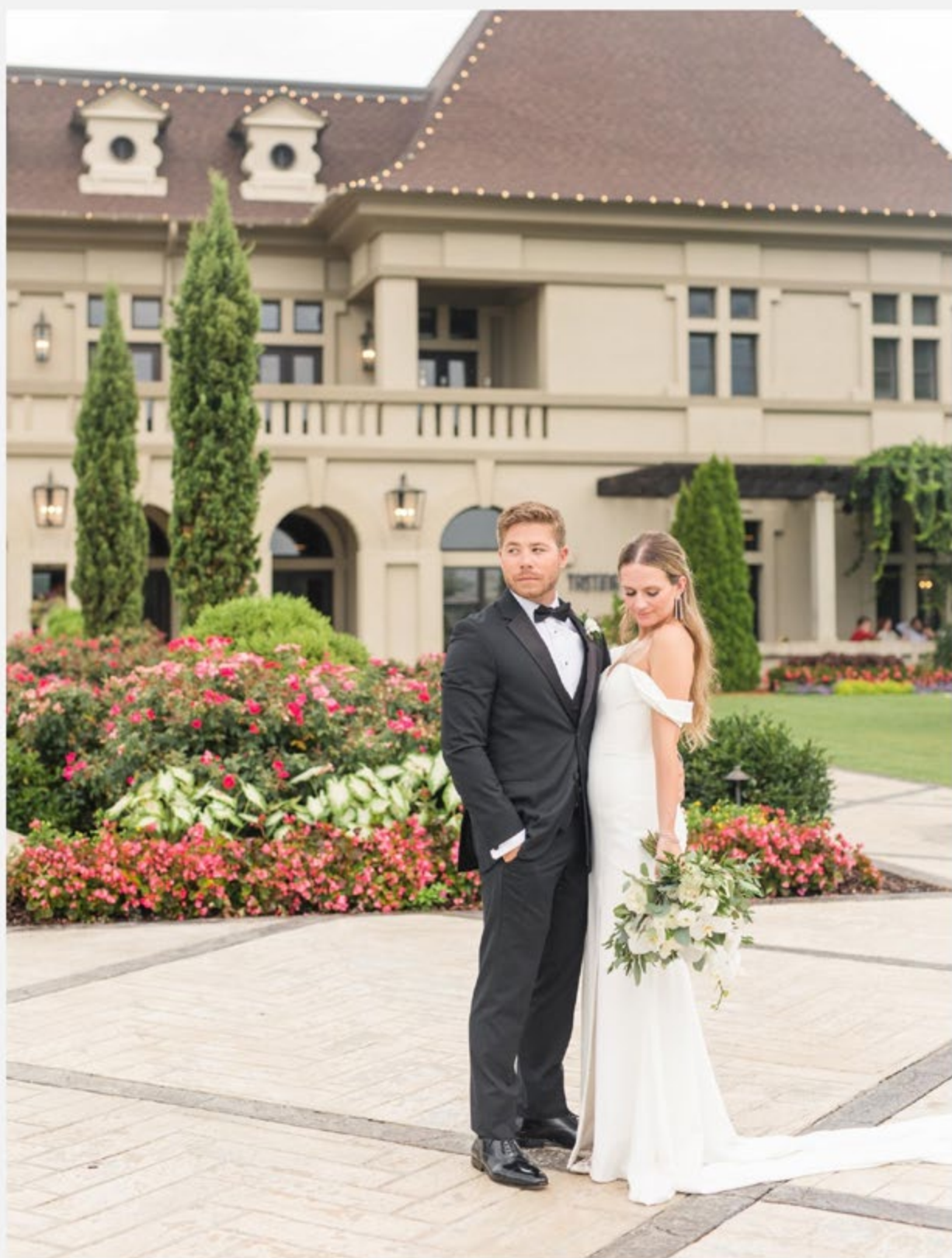
Chateau Elan | Brasleton, GA