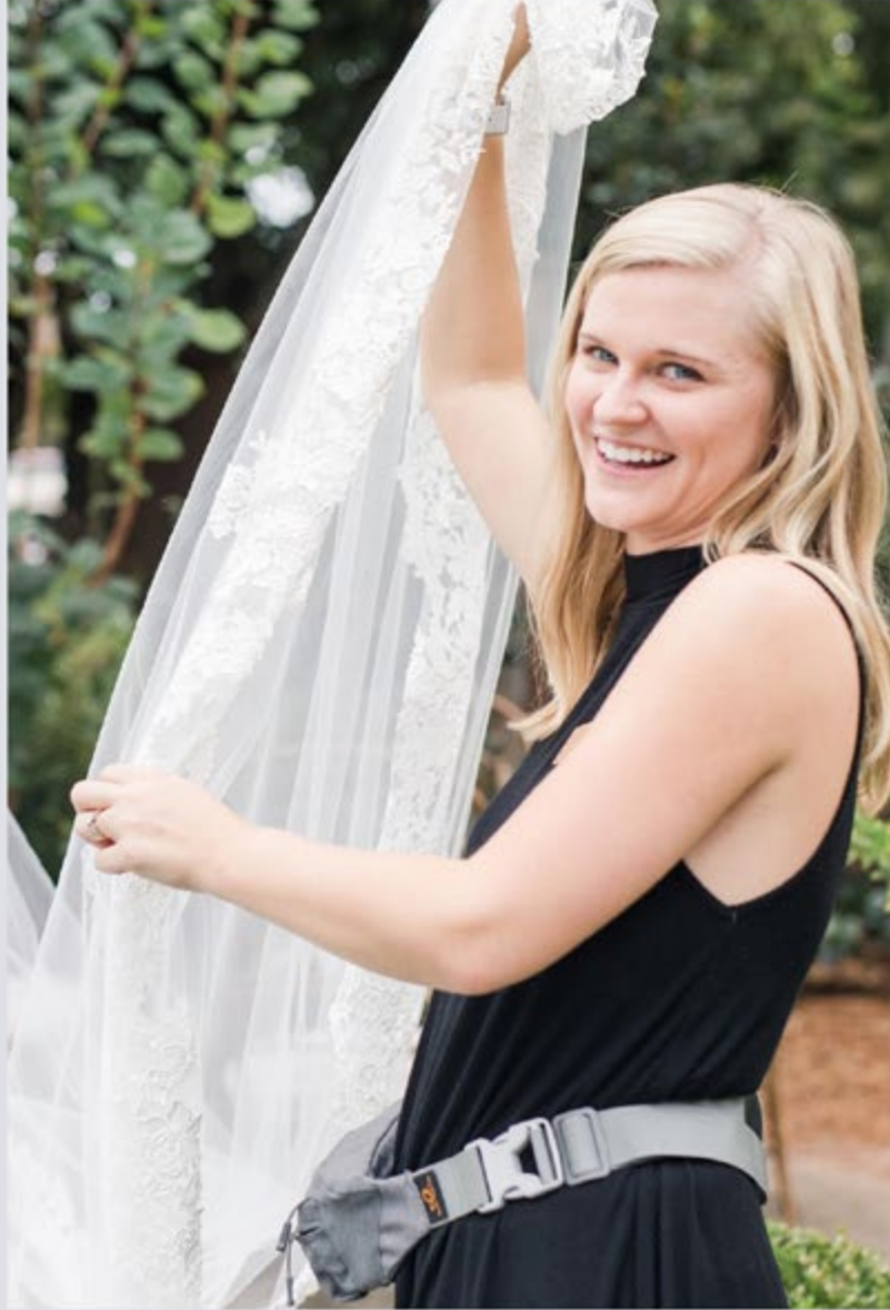
255 Milledge Hardeman-Sams House | Athens, GA