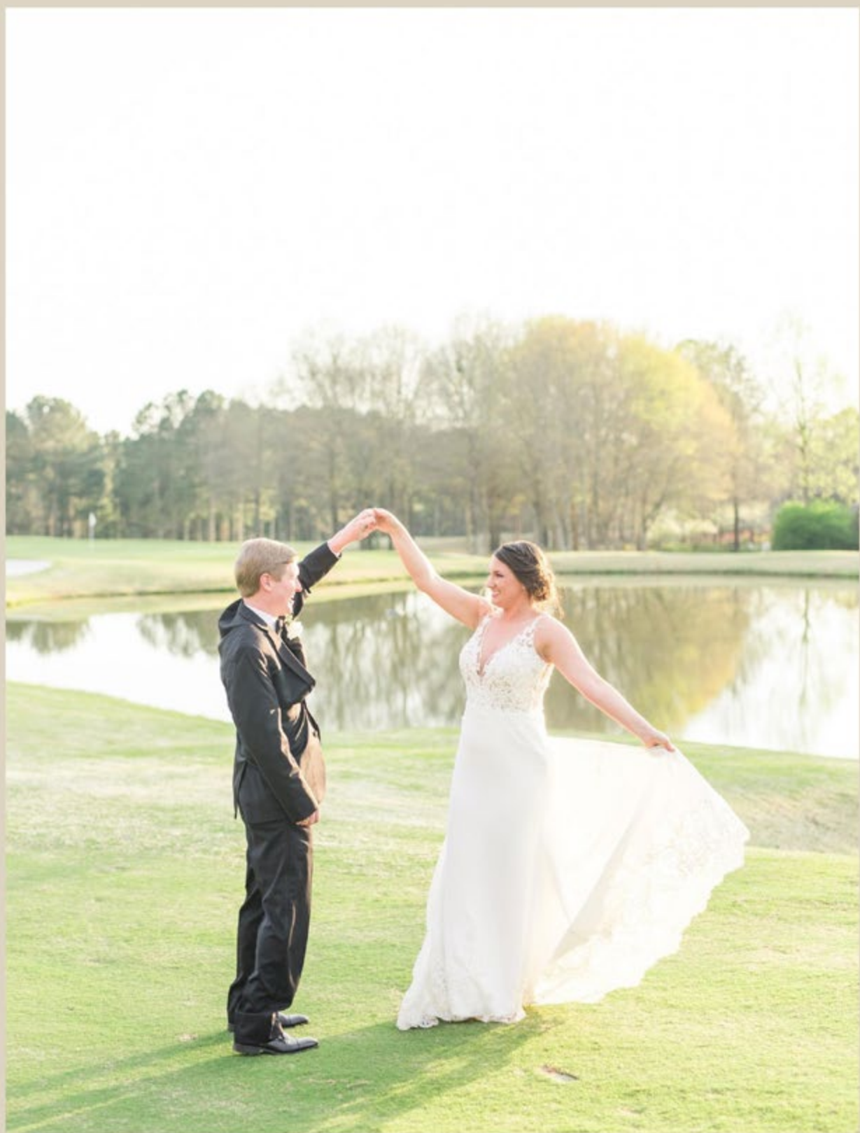
Georgia Club | Statham, GA