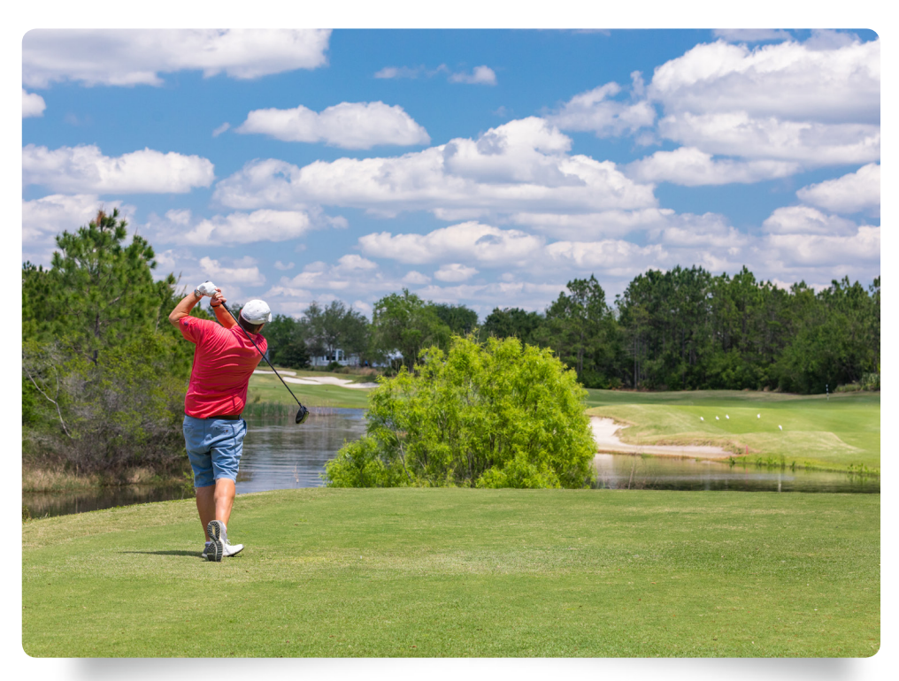
THE CLUBS BY JOE® WEDDING EXPERIENCE

*Private Amenity Available To WaterColor Inn and The Pearl Registered Guests and The Clubs by JOE Members Only.