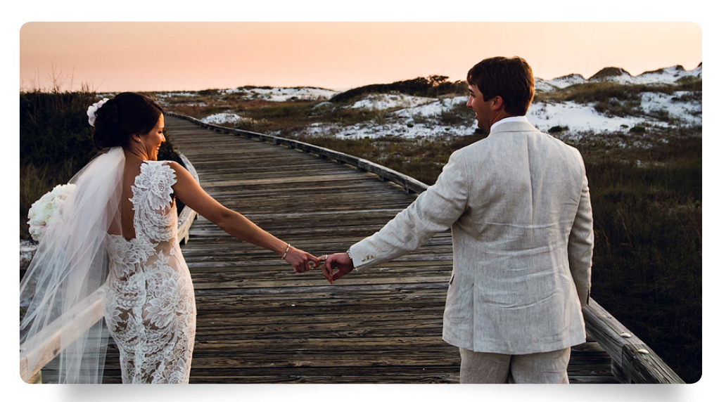
THE CLUBS BY JOE® WEDDING EXPERIENCE

++21% service charge and 7% sales tax will be added to per person pricing.