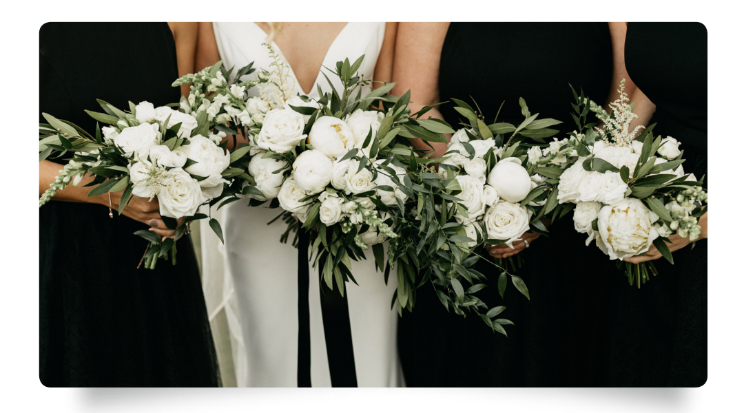
THE CLUBS BY JOE® WEDDING EXPERIENCE

Signature Events 850.541.4647 signatureweddingsandevents.com