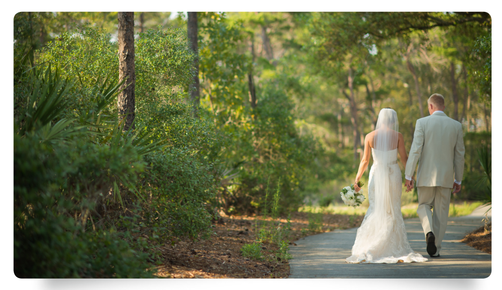
THE CLUBS BY J® WEDDING EXPERIENCE