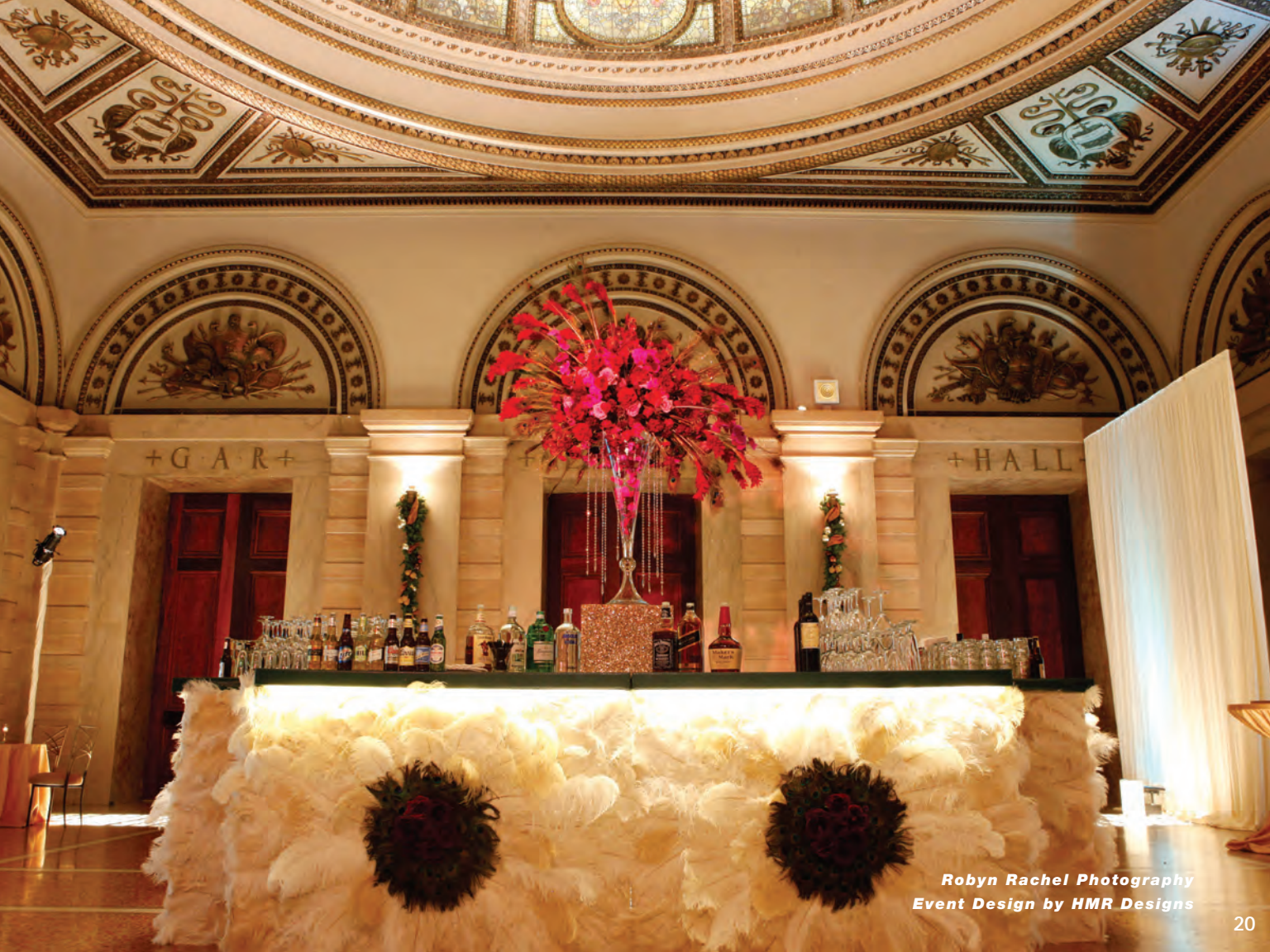
Event Design by HMR Designs