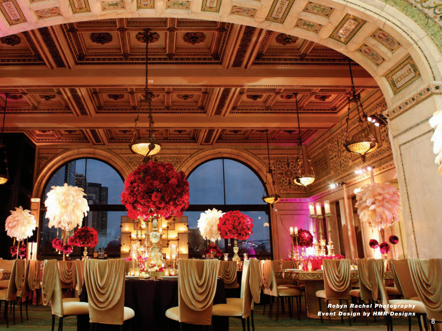
Event Design by HMR Designs