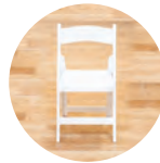
White Folding Chair