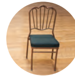
Green/Gold Metal Chair

**All rentals such as linen, china, glassware, flatware, floral, etc. must be outsourced directly by the client**