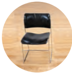
Black Metal Chairs included in rental fees