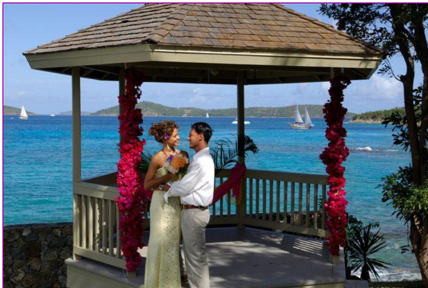
Upper Gazebo: smaller, close to building 15 and pool, on a grassy slope.

We look forward to having you as our guest on your special day. If there is any other way we can assist, please give us a call at 1-800-323-7229 or visit our website at www.gallowspointresort.com .