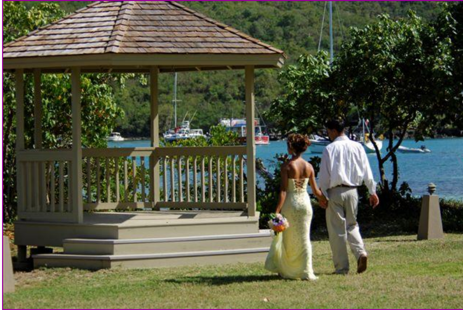
Lower Gazebo – Harbor side, large grassy area, low and flat. A road leads down to the area. The gazebo is across the way from the rental buildings.

The following are photos of the two gazebos we offer for your wedding ceremony: