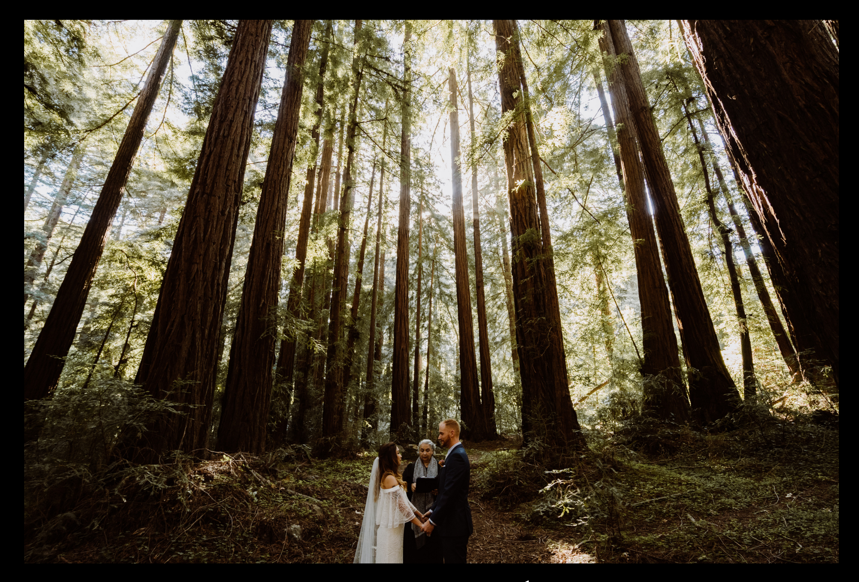
2024 Pricing Guide