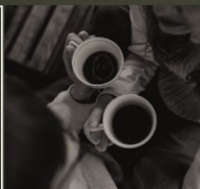
PHOTO DELIVERY - 24 HOURS, 2-3 WEEKS

I WILL SEND MY PROPOSAL GUIDE TO YOU WHICH WILL COVER LOCATION AND OUTFIT ADVICE. FOR THIS SESSION, THE ONLY OUTFIT AND LOCATION INCLUDED IS THE ONE FOR THE BIG MOMENT!