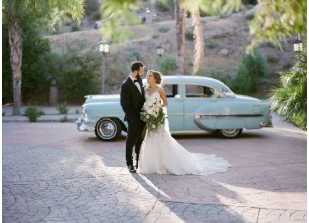
** All wedding packages can be completely altered to suit your specific need and budget.