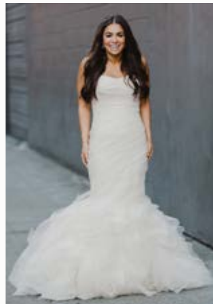
SAMMY + DAN SODO PARK, SEATTLE WA

We've compiled our most popular planning + design requests into three options. However, as always, please inquire with specifics regarding your event. Chances are we can tailor a custom option combining many of our services.