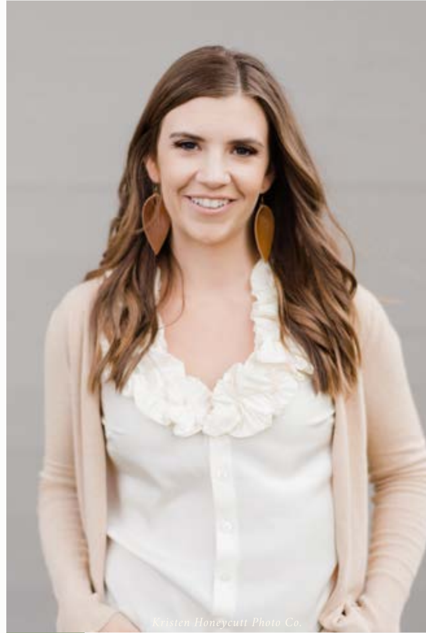
Kristen Honeycutt Photo Co.