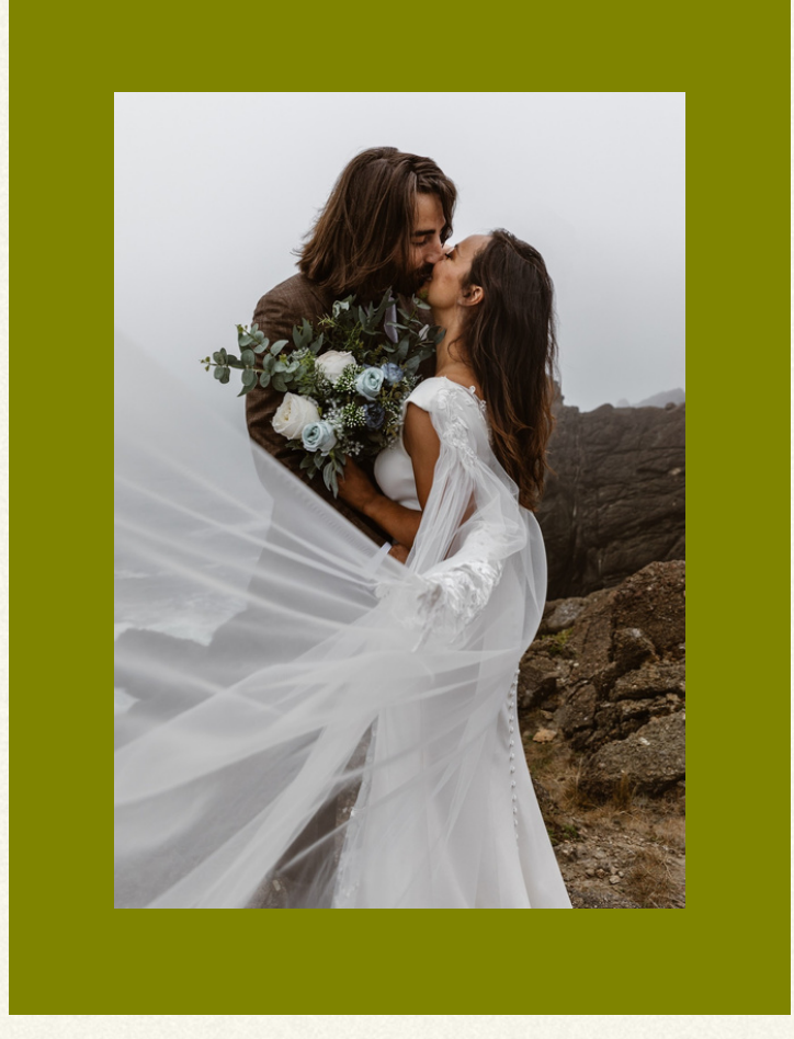
United States $5,800 International $7,800