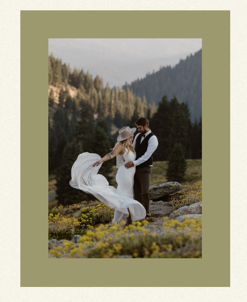
United States $7,800 International $9,800