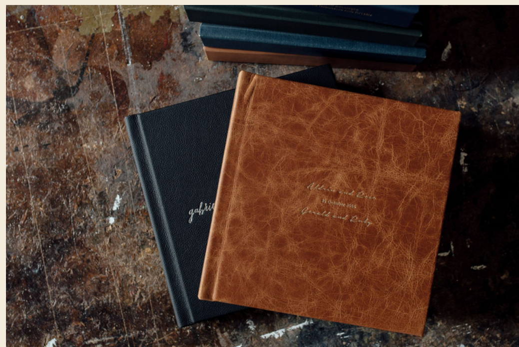
Photo albums are a must in my opinion. Looking at a computer screen is not the same. Having a physical book to hold and reminisce about your day is so wonderful. It's nice to share with friends and family when they come over and it's nice to be able to look at it together through thick and thin.