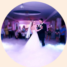
DANCING ON CLOUDS: $150