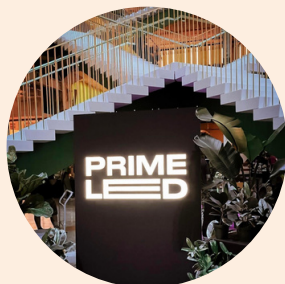
LED PANELS: $90 each