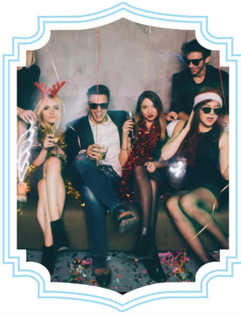
The Photo Bomb $375

Make Your Day Pop with this Free Standing Ring Light Photo Booth