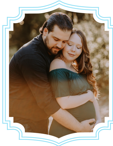
Package Two $250