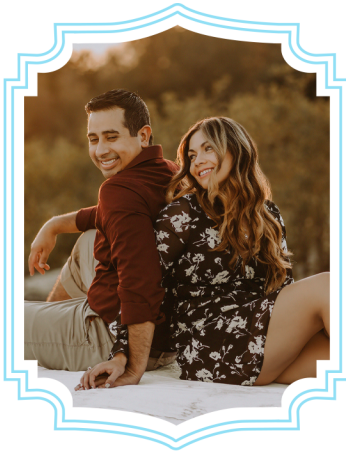
Package One $200