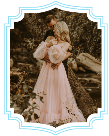
Package Three $300

30 Min. Session 15 Professional Edits All Edits in Color & B&W Online Gallery Print Release