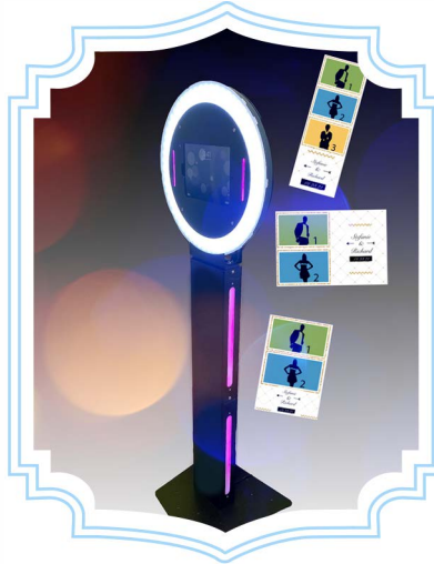
The Shutter Bug $650