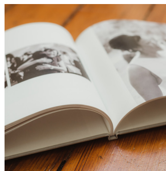
PHOTO BOOK ALBUM

11" x 8.5" horizontal Up to 100 matte archival pages Fabric cover with customizable half dust jacket